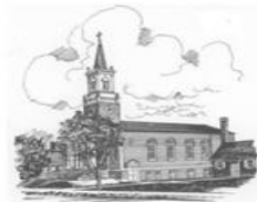
DONATE TO HELP RENOVATE

Townley Church needs help to fund several significant repairs. We appreciate your donations to our “Cherish The Church” Capital Improvement Campaign.