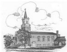
DONATE TO HELP RENOVATE

Townley Church needs help to fund several significant repairs. We appreciate your donations to our “Cherish The Church” Capital Improvement Campaign.